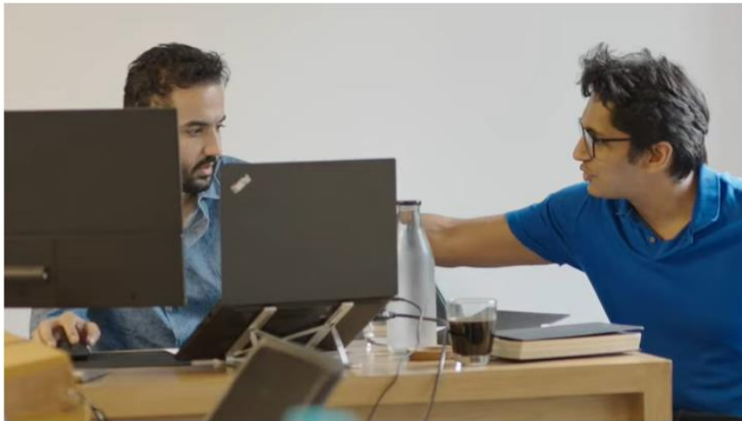
Forge With PayU | They Wanted Customers To Drool Over Coffee And PayU Made It Seamless.