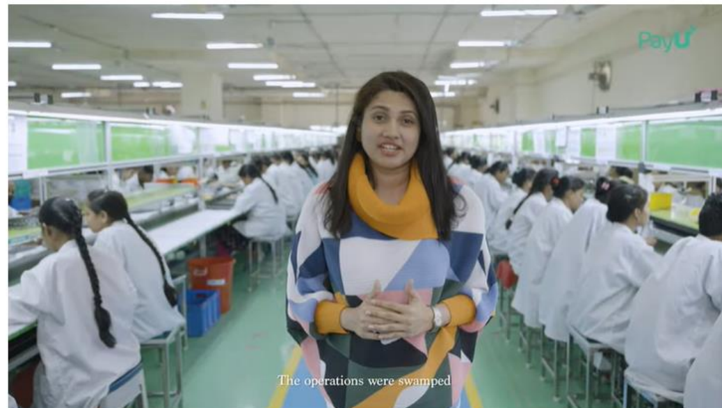
Episode 2: Forge With PayU x MIVI India